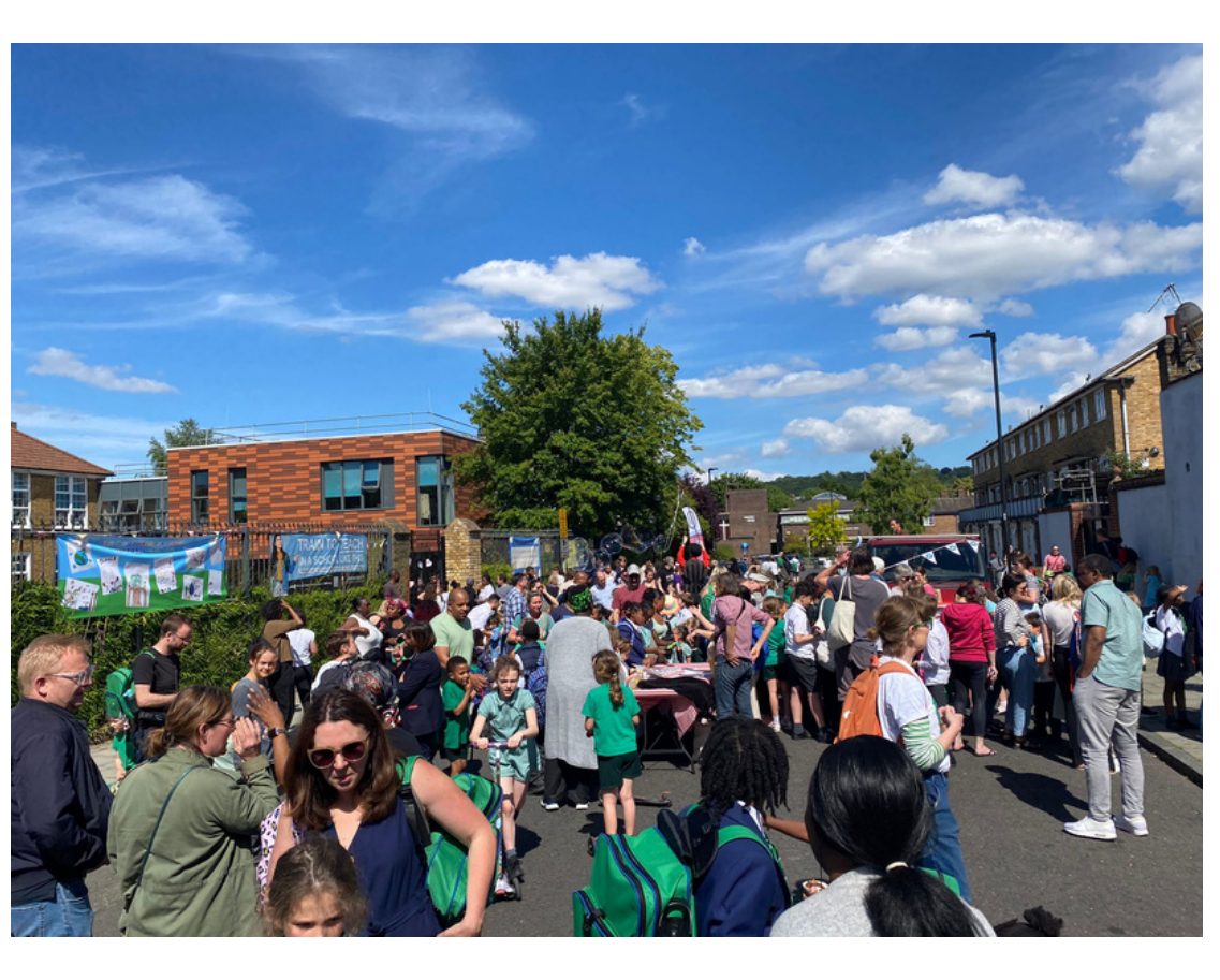
charity number 1031751